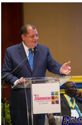
Jamaica's Minister of Finance and Public Service, Hon. Audley Shaw opening CGS2017 Summit

On June 14 and 15, Jamaica open doors to celebrate the 7th Anniversary of the Caribbean Gaming Show & Summit. Topics and Speakers from all over the world were selected to join us in this new edition. The BGLC support and endorsement was vital. As one of our Platinum Sponsors this event had the presence of important local Authorities that gave the Summit a Top Level. By far, and out of discussion the Best Summit of the year in Latin America and the Caribbean.